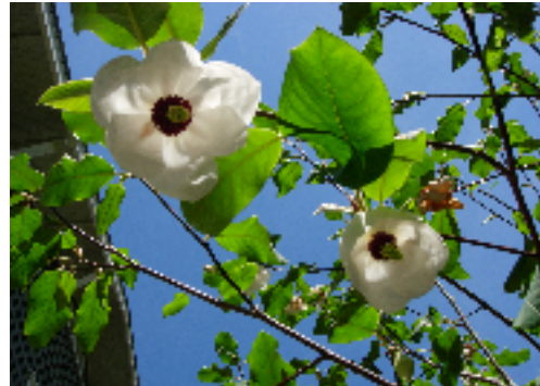
(This photo: Magnolia wilsonii )

Dawyck European beech ( Fagus sylvatica 'Dawyck Gold', 'Dawyck Purple', 'Dawyck')